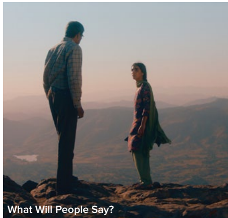
What Will People Say?

See more and save with the 3+ film package!